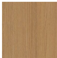
Honey 64240 LRV 25.6