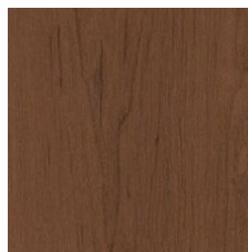
Earthen 64710 LRV 10.4