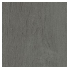
Mercury 64530 LRV 26.9