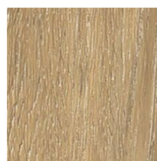
Buff 64140 LRV 30.3