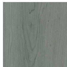
Alloy 64515 LRV 33.2