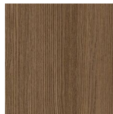
Bark 64720 LRV 14.1