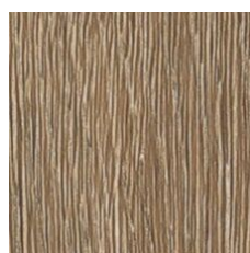
Cocoa 64103 LRV 20.3