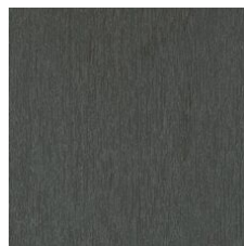
Cinder 64557 LRV 18