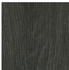
Char 64549 LRV 7.4