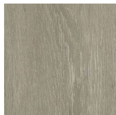
Ashen 64155 LRV 27.7