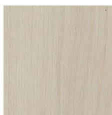
Alabaster 64114 LRV 47.9