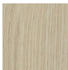
Parchment 64111 LRV 43.4