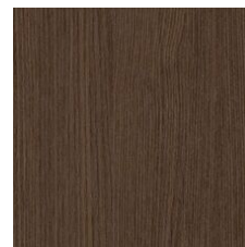
Clove 64740 LRV 8 V2 - Slight Variation